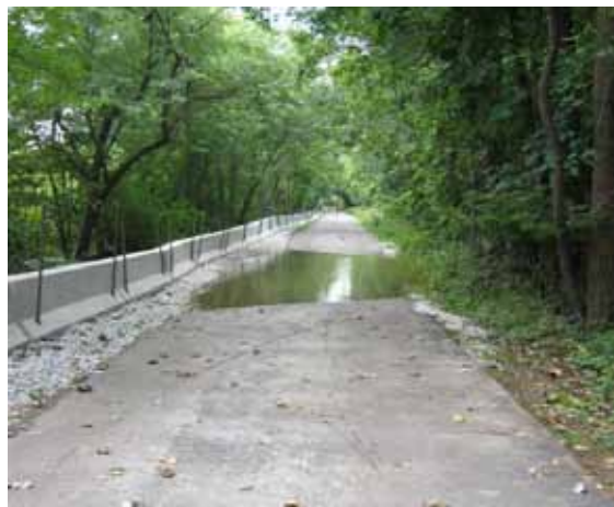
Completed concrete barriers prevented overtopping in the July 24-25 flood event of 2010 along the Des Plaines River.

The first report the Corps completed under this authority identified areas of potential bypass of fish through neighboring waterways upstream of the electric barriers during flooding and recommended construction of a barricade along the Des Plaines River, which was completed in October 2010, along with a stone blockage in the I&M Canal, completed in June 2010.